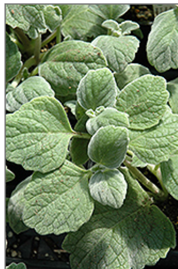
Nicoletta Swedish Ivy foliage