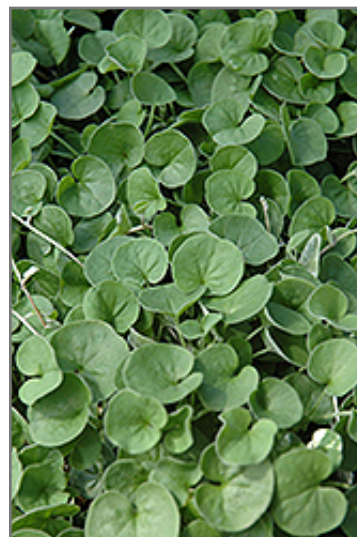
Emerald Falls Dichondra foliage