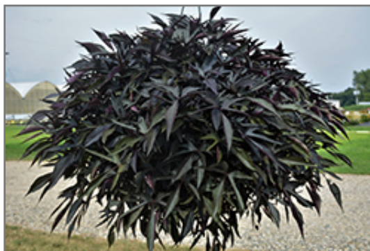
Illusion Midnight Lace Sweet Potato Vine