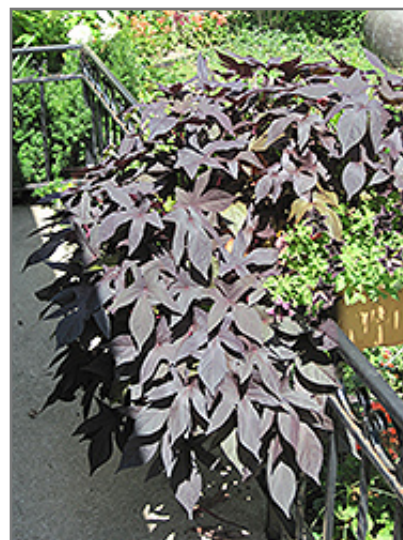
Proven Accents Blackie Sweet Potato Vine