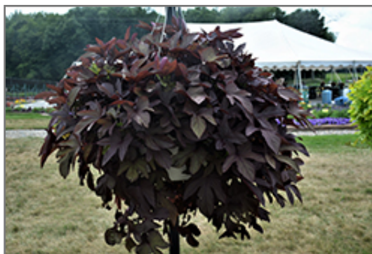
Sweet Caroline Red Sweet Potato Vine