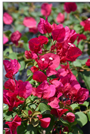
Barbara Karst Bougainvillea flowers