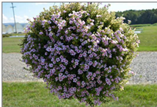
Snowstorm Pink Bacopa in bloom