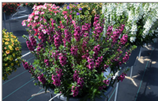
Archangel Raspberry Angelonia in bloom