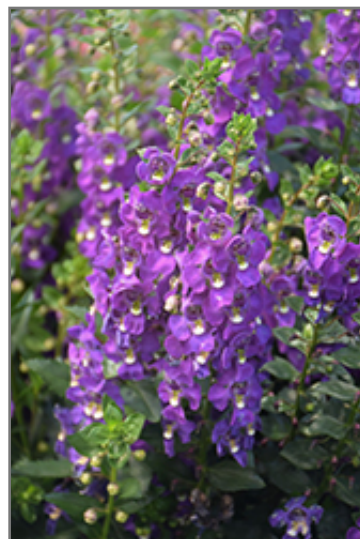
Archangel Purple Angelonia flowers

Archangel Purple Angelonia is recommended for the following landscape applications;