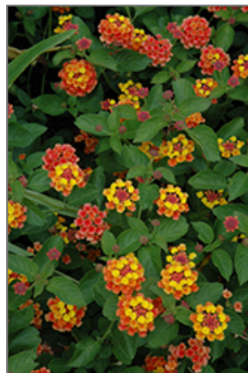
Landmark Citrus Lantana flowers