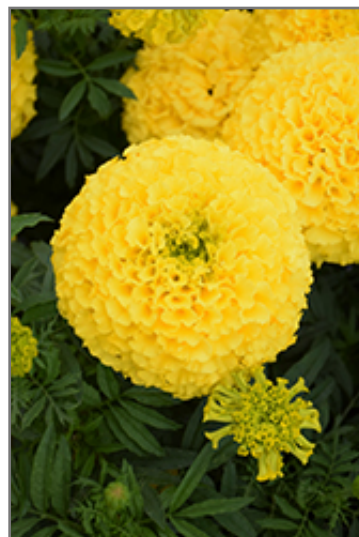
Marvel Yellow Marigold flowers

Marvel Yellow Marigold is recommended for the following landscape applications;