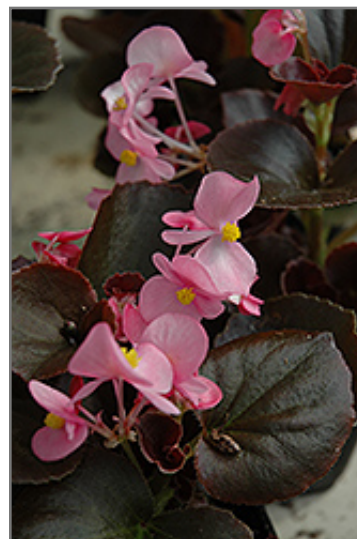
Cocktail Gin Begonia flowers