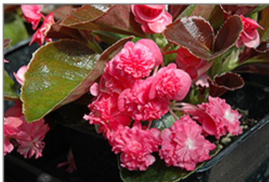
Doublet Rose Begonia flowers