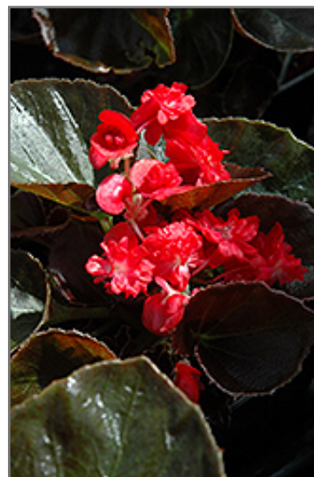
Doublet Red Begonia flowers