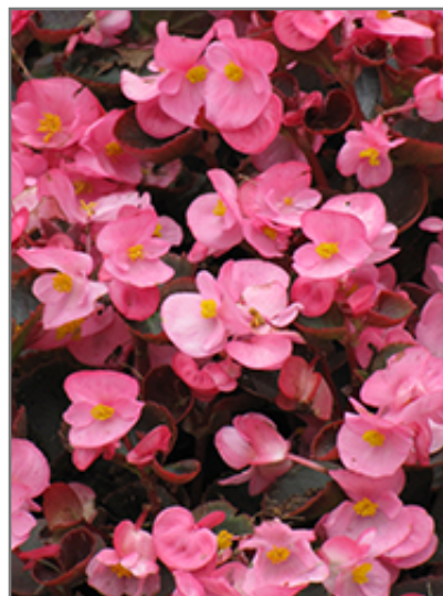
Bada Boom Pink Begonia flowers