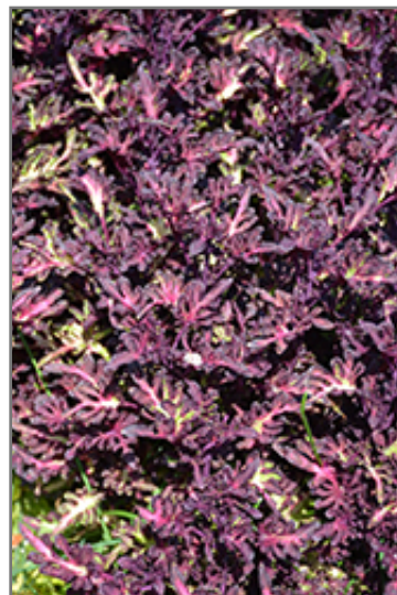
Merlin's Magic Coleus foliage