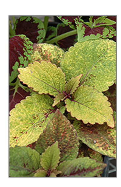
Honey Crisp Coleus foliage

and will usually leave it alone in favor of tastier treats. It has no significant negative characteristics.