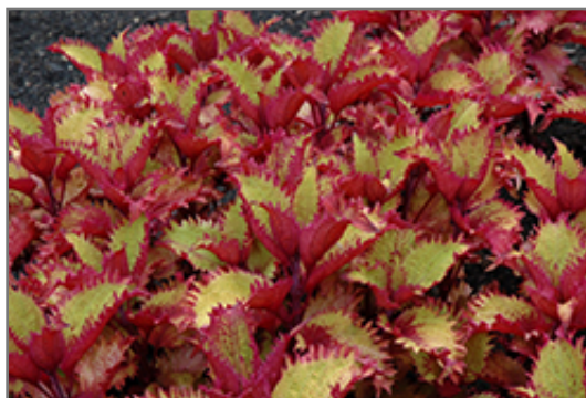
Henna Coleus foliage