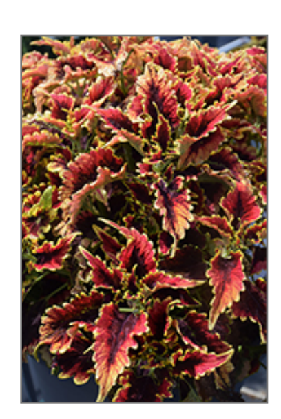
El Brighto Coleus foliage

El Brighto Coleus is an herbaceous annual with an upright spreading habit of growth. Its relatively fine texture sets it apart from other garden plants with less refined foliage.