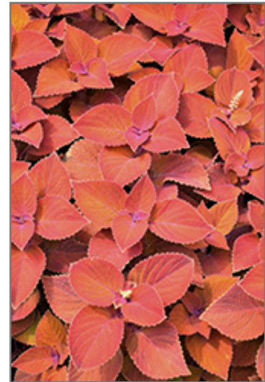
ColorBlaze Sedona Sunset Coleus foliage