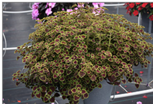
Burgundy Wedding Train Coleus