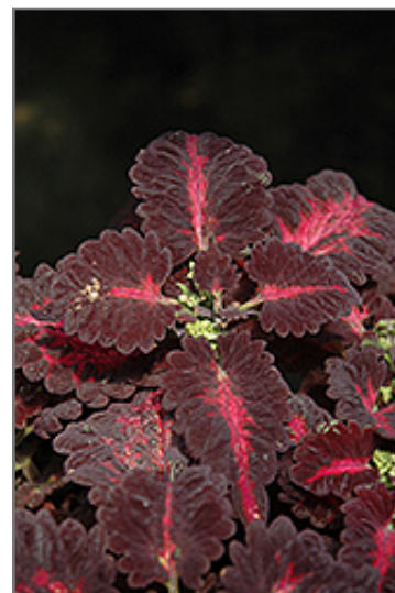
Black Dragon Coleus foliage