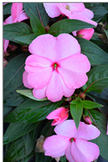
Sonic Light Pink New Guinea Impatiens flowers