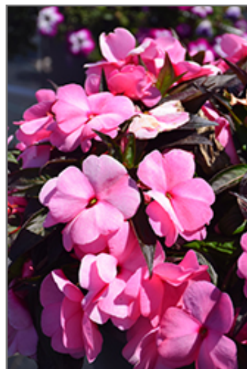
Sonic Light Pink New Guinea Impatiens flowers

Sonic Light Pink New Guinea Impatiens is recommended for the following landscape applications;