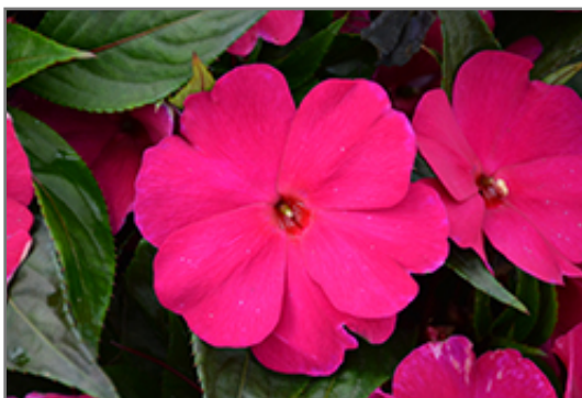
Magnum Purple New Guinea Impatiens flowers

Magnum Purple New Guinea Impatiens is recommended for the following landscape applications;