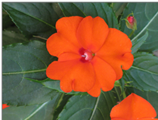
Infinity Orange New Guinea Impatiens flowers

Infinity Orange New Guinea Impatiens is recommended for the following landscape applications;