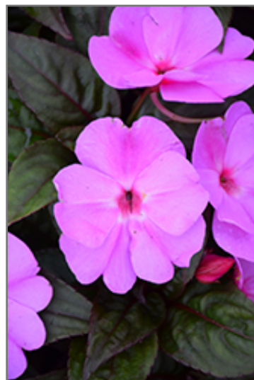
Divine Lavender New Guinea Impatiens flowers

Divine Lavender New Guinea Impatiens is recommended for the following landscape applications;