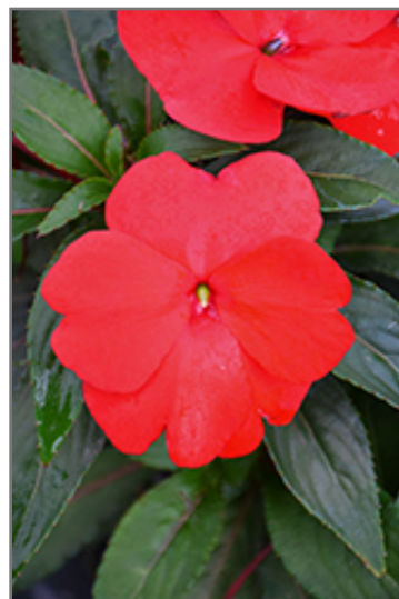
Super Sonic Red New Guinea Impatiens flowers

Super Sonic Red New Guinea Impatiens is recommended for the following landscape applications;