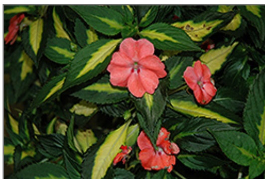
SunPatiens Spreading Variegated Salmon New Guinea Impatiens flowers