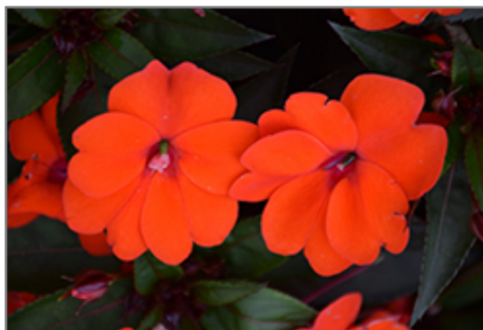
SunPatiens Compact Orange New Guinea Impatiens flowers

This plant will require occasional maintenance and upkeep, and should not require much pruning, except when necessary, such as to remove dieback. It is a good choice for attracting bees and butterflies to your yard. It has no significant negative characteristics.