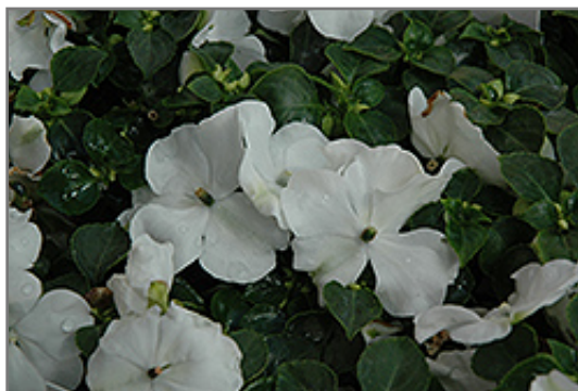
Show Off White Impatiens flowers