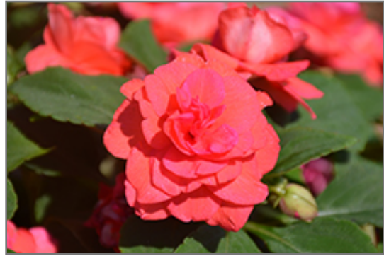
Rockapulco Coral Reef Impatiens flowers

Rockapulco Coral Reef Impatiens is recommended for the following landscape applications;