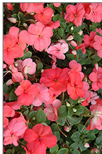
Super Elfin XP Melon Impatiens flowers