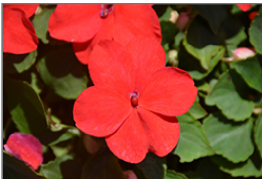
Super Elfin XP Melon Impatiens in bloom

Super Elfin XP Melon Impatiens is recommended for the following landscape applications;