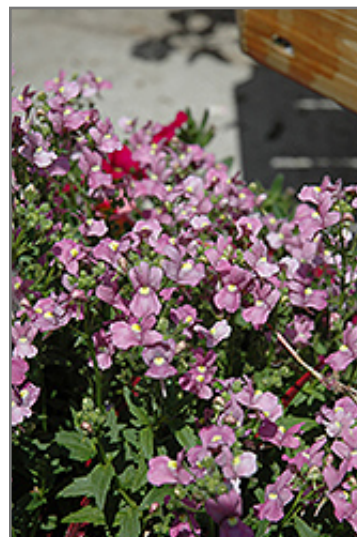
Compact Pink Innocence Nemesia flowers