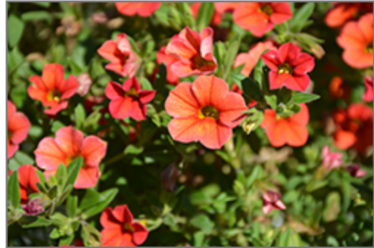
Can-Can Orange Calibrachoa flowers

This plant will require occasional maintenance and upkeep. Trim off the flower heads after they fade and die to encourage more blooms late into the season. It is a good choice for attracting bees and hummingbirds to your yard, but is not particularly attractive to deer who tend to leave it alone in favor of tastier treats. It has no significant negative characteristics.