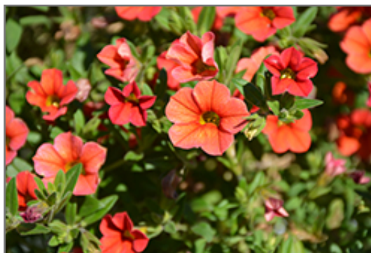
Can-Can Orange Calibrachoa flowers

This plant will require occasional maintenance and upkeep. Trim off the flower heads after they fade and die to encourage more blooms late into the season. It is a good choice for attracting bees and hummingbirds to your yard, but is not particularly attractive to deer who tend to leave it alone in favor of tastier treats. It has no significant negative characteristics.