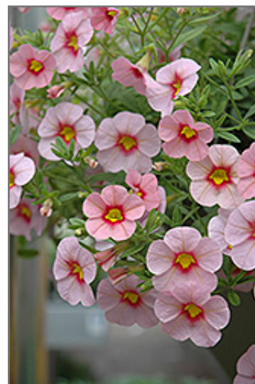
Aloha Tiki Soft Pink Calibrachoa flowers