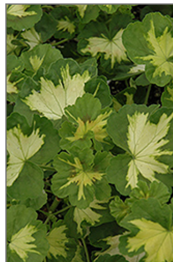
Happy Thought Geranium foliage