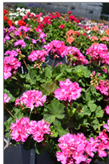
Fantasia Shocking Pink Geranium in bloom