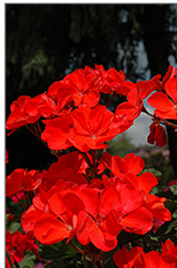
Fantasia Coral Geranium flowers