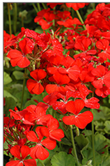
Crystal Palace Gem Geranium flowers