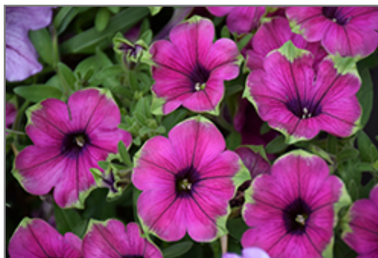
Supertunia Pretty Much Picasso Petunia flowers