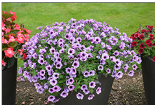
Supertunia Bordeaux Petunia in bloom

Supertunia Bordeaux Petunia is a fine choice for the garden, but it is also a good selection for planting in outdoor containers and hanging baskets. Because of its trailing habit of growth, it is ideally suited for use as a 'spiller' in the 'spiller-thriller-filler' container combination; plant it near the edges where it can spill gracefully over the pot. Note that when growing plants in outdoor containers and baskets, they may require more frequent waterings than they would in the yard or garden.