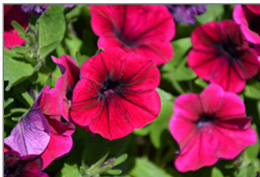
Shock Wave Deep Purple Petunia flowers