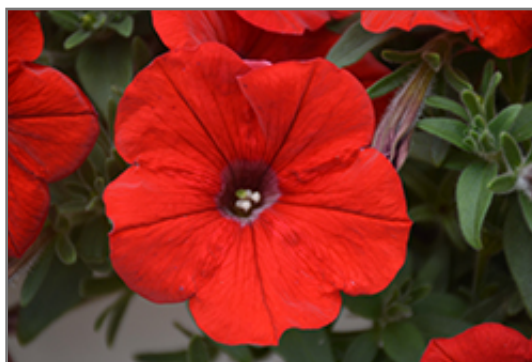
Sweetunia Hot Rod Red Petunia flowers