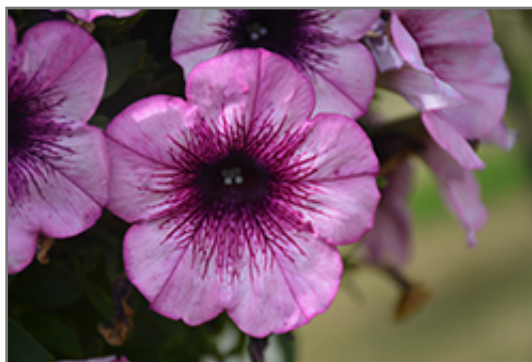
Sweetunia Grape Ice Petunia flowers