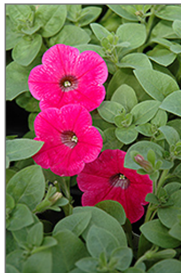
Piccola Hot Pink Petunia flowers