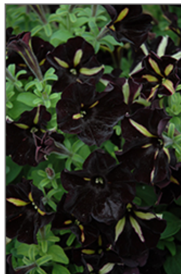
Phantom Petunia flowers