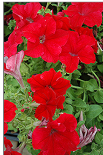
Dreams Red Petunia flowers