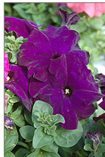
Dreams Midnight Petunia flowers