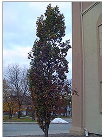
Pyramidal English Oak in fall