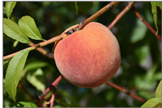
Redhaven Peach fruit

Redhaven Peach is covered in stunning clusters of fragrant pink flowers along the branches in early spring, which emerge from distinctive rose flower buds before the leaves. It has dark green deciduous foliage. The narrow leaves turn yellow in fall. The fruits are showy yellow drupes with a red blush, which are carried in abundance in mid summer. The fruit can be messy if allowed to drop on the lawn or walkways, and may require occasional clean-up.